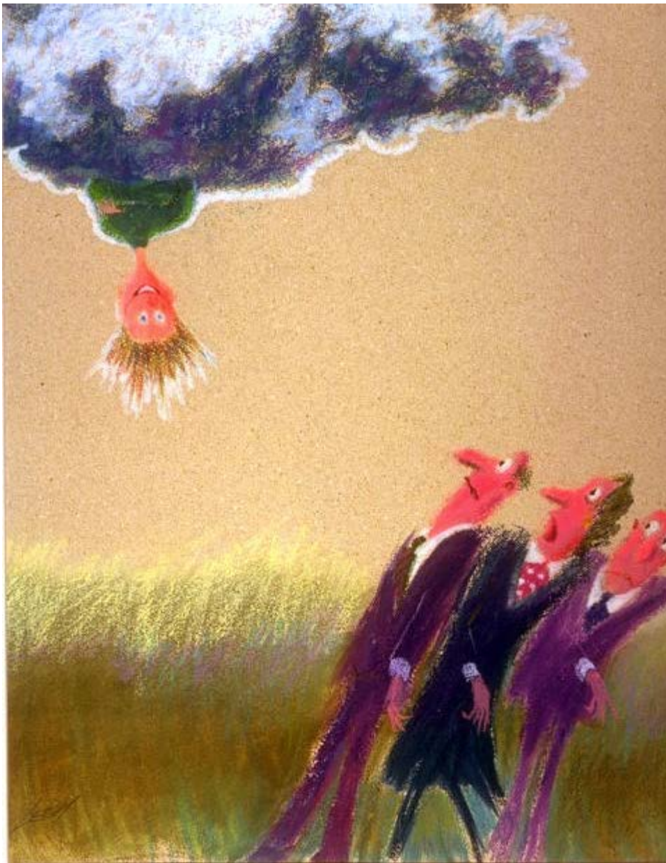
"I Tried Reality. It Just Didn't Work For Me." (now in 9 x 12 @ $32 unframed-know someone like this?)