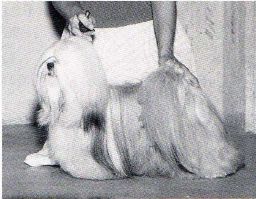
CH. FLEETFIRE FASH ON RED