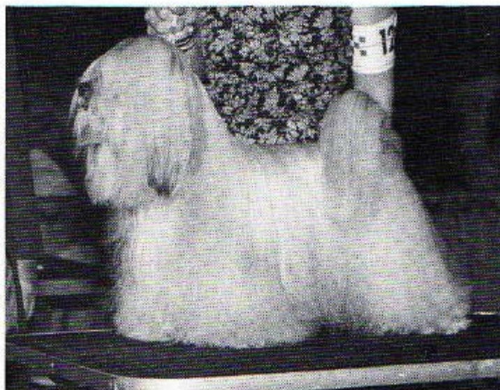
CH. NYIMA A LITTLE NACHAS

LU How do you feel about the quality of Lhasas in different parts of the country and abroad?