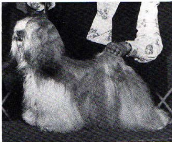
CH. AURORA'S KIM-TU DYNASTY

LU What do you feel is the ideal size for a dog and the ideal size for a bitch? Which would you penalize more severely - too small or too large?