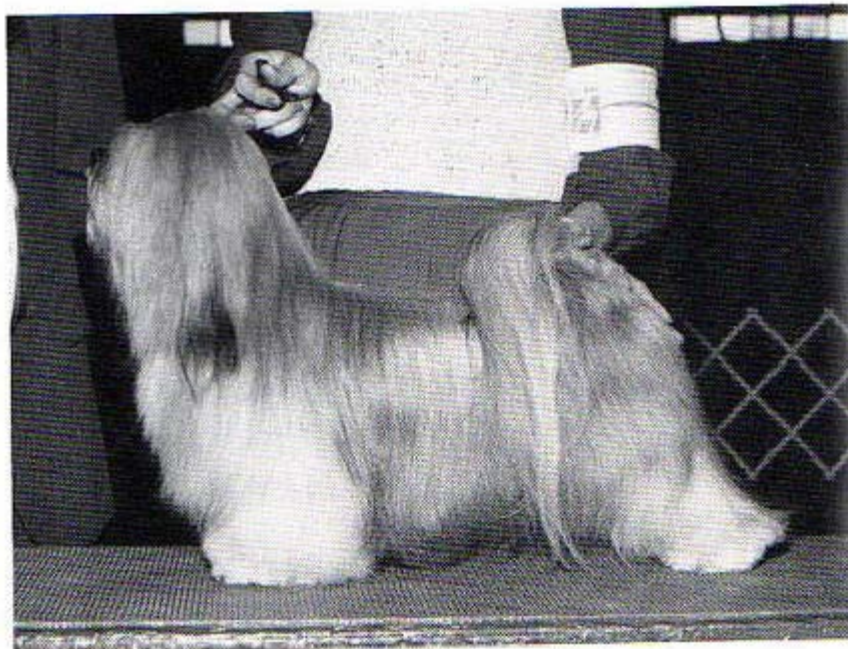
CH. FLEETFIRE RED ZIN-GER

LU Name several Lhasa Apsos not owned by yourself, that have impresses you over the years as outstanding representatives of the breed. For what particular reasons?