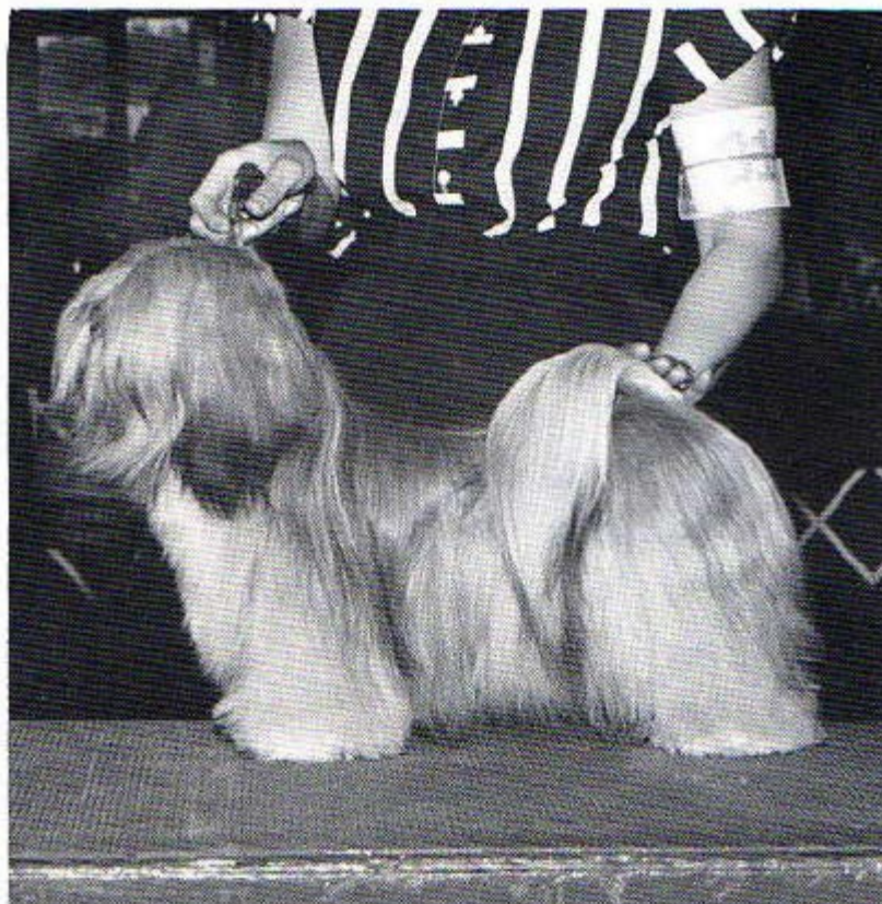
CH. FLEETFIRE ZHEL LEE BHEL LEE