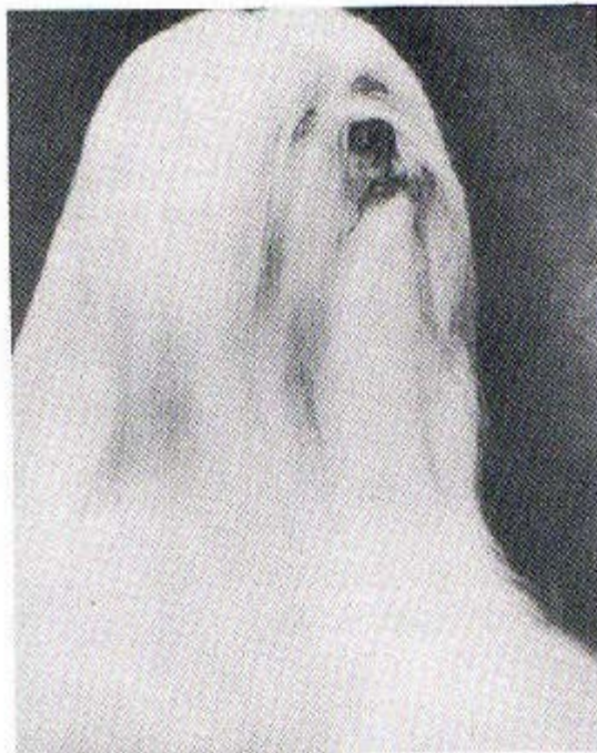
CH. NIAL'S FLEETFIRE O' BLU PATINA

FL Fleetfire started with fine quality Lhasa Apsos and we've been able to continue that heritage while blending our foundation stock. The focus right now is on consistently producing good coats and our head type on our style of Lhasa, using the breed standard as a blueprint. When that goal has been reached we will strive for creating animals uniform in size with reverse scissors bites.