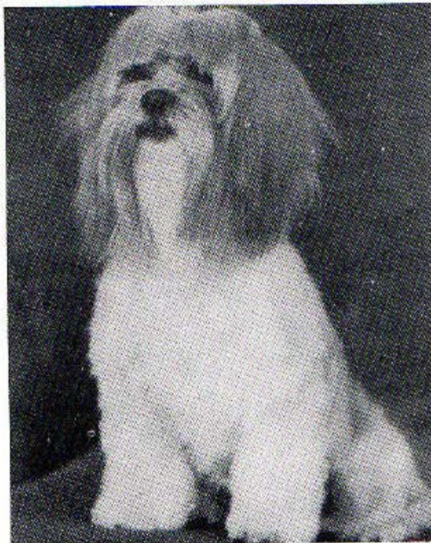
CH. ALMONT'S JB OF NYIMA

LU Do you feel politics are involved on the breed level? In dog shows in general?